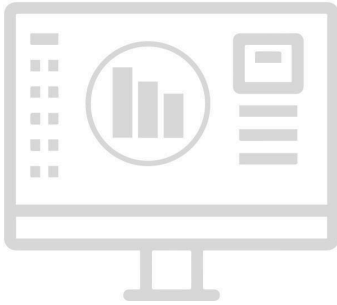
Refine Foundational Concepts