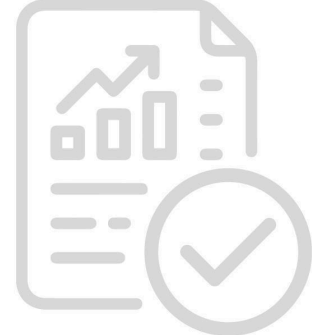
Reviewing Analysis Results and Design Output