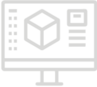
Navigating the ADAPT-Builder Interface